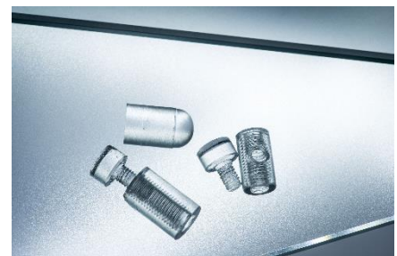
With Glassomer, glass components similar to that shown above can be produced by cutting.