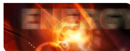
KIT Energy Center: Having future in mind