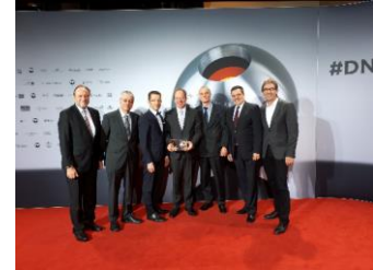
German Sustainability Award in the category of research: The winners at the awards ceremony in Düsseldorf.

The photos in the best quality available to us may be downloaded under www.kit.edu or requested by mail to presse@kit.edu or phone +49 721 608-47414. The photos may be used in the context given above exclusively.