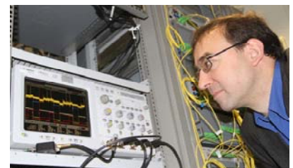
Control of the signal levels: Professor Jürg Leuthold.

"A few years ago, data rates of 26 terabits per second were deemed utopian even for systems with many lasers." Leuthold adds, "and there would not have been any applications. With 26 terabits per second, it would have been possible to transmit up to 400 million telephone calls at the same time. Nobody needed this at that time. Today, the situation is different." Video transmissions predominate on the internet and require extremely high bit rates. The need is growing constantly. In communication networks, first lines with channel data rates of 100 gigabits per second (corresponding to 0.1 terabit per second) have already been taken into operation. Research now concentrates on developing systems for transmission lines in the range of 400 Gigabits/s to 1 Tbit/s. Hence, the Karlsruhe invention is ahead of the ongoing development. Companies and scientists from all over Europe were involved in the experimental implementation of ultra-rapid data transmission at KIT. Among them were members of the staff of Agilent and Micram Deutschland, Time-Bandwidth Switzerland, Finisar Israel, and the University of Southampton in Great Britain.