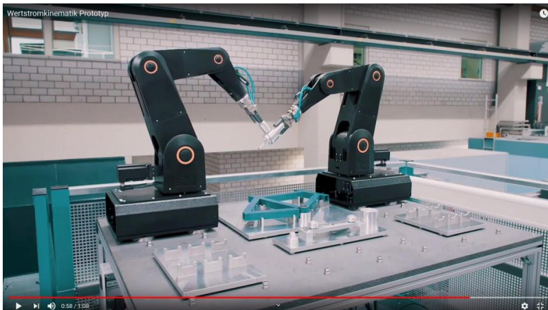
The prototype at work – video available at https://www.youtube.com/watch?v=VraoQXya1a4&t=0s .

“Value-stream kinematics have the potential to revolutionize today’s production landscape,” says Professor Jürgen Fleischer, head of the wbk institute and initiator of the novel production approach. It could obviate the need for large halls and avoid long supply chains or production losses due to supply bottlenecks. The current crisis caused by the pandemic has shown how quickly the lines can come to a standstill if supplies from abroad required for production are not available in time. “If our flexible systems were in use, regional companies in the immediate vicinity could step in and manufacture the missing parts. The reduction of transport distances would also be environmentally friendly and resource-saving,” Fleischer emphasizes.