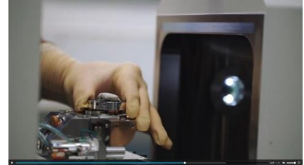
Video “Von Käfern lernen: Oberflächen nach dem Vorbild der Natur“ (learning from beetles – surfaces modeled on nature)

“We avoid the use of pigments that are harmful to health and the environment by producing porous polymer structures of comparably high scattering efficiency,” Hölscher says. He and his team were inspired by the white beetle Cyphochilus insulanus , whose chitin scales appear white thanks to their special nanostructure. “Based on this model, we produce polymer-based solid, porous nanostructures, which resemble a sponge,” says Hölscher, who heads the Biomimetic Surfaces Group of IMT. Similar to the bubbles of shaving or bathing foam, the structure scatters light, which makes the material appear white. The new technology for low-cost and environmentally compatible white optics is suited for various surfaces.