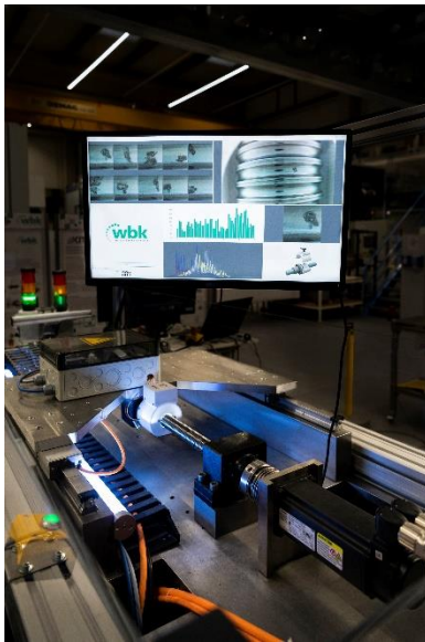
System developed at KIT for fully automatic wear control of ball screws by using artificial intelligence.

Wear on the spindle in ball screws can be continuously monitored and evaluated with an intelligent system by KIT