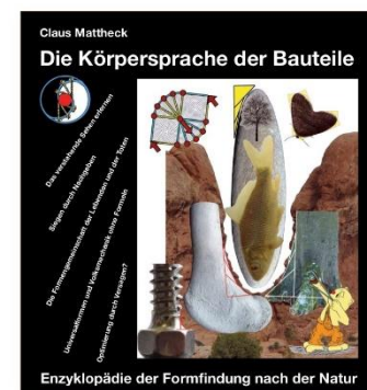
Title page of the book “Die Körpersprache der Bauteile“ by Claus Mattheck.

This press release is available on the internet at www.kit.edu .