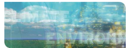
KIT Climate and Environment Center: For an environment worth living in

Aerosols are smallest suspended particles originating from a variety of natural and anthropogenic sources. Most of them act as condensation nuclei for the formation of water droplets in clouds, which freeze at about -35^{\circ}\text{C} . “Only a very small fraction of the particles, such as dust particles, make the water droplets freeze slightly below 0^{\circ}\text{C} already. Formation of these ice nuclei frequently is responsible for the formation of precipitation. Hence, this process is of essential relevance to better forecasts of the spatial and