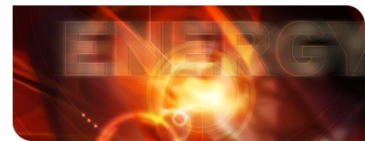
KIT Energy Center: Having future in mind

The materials used so far are based on intercalation storage of lithium in small cavities (so-called interstitials), in a host structure that usually consists of metal oxides. This method works well, but the storage densities reached are limited, as lithium cannot be packed very densely in the structure. In addition, intercalation storage of more than one lithium ion per formula unit is generally not possible, as the structure then is no longer stable and collapses. It would