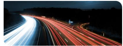
KIT Mobility Systems Center: Solutions for tomorrow's mobility