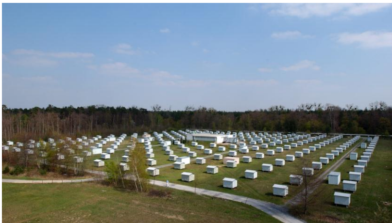
The KASCADE-Grande measurement field on the premises of KIT was used by scientists to study particle showers produced by cosmic rays.

KIT's KASCADE-Grande Experiment Provides Indications of an Extragalactic Component of Cosmic Rays