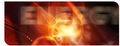
KIT Energy Center: Having future in mind