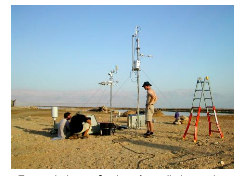
Energy balance: Stations for radiation and evaporation measurement.