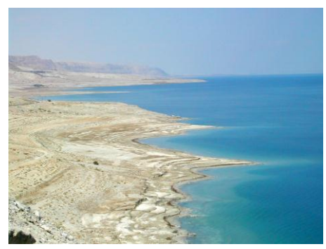
The Dead Sea as an outdoor laboratory: The sea level drops by one meter per year.