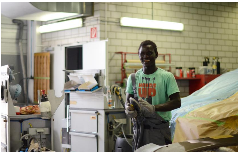
Welcome2Work brings together interested refugees and companies. Mentors help refugees integrate into the labor market.

Enactus Helps Refugees Get a Job in Germany – Interested Persons Are Invited to Support the Project by Crowdfunding