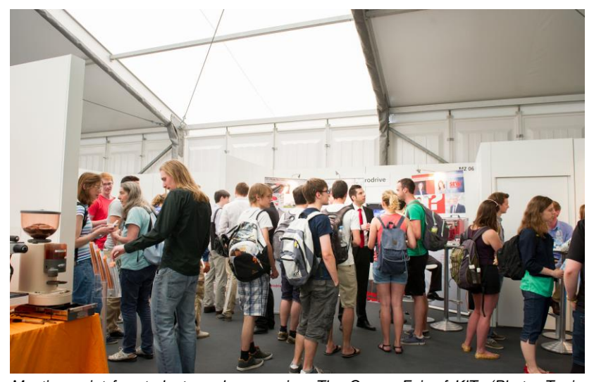
Meeting point for students and companies: The Career Fair of KIT.

Regional, National, and International Employers Present Themselves on Campus South of KIT – Framework Program with Workshops, Presentations, and Application Photo Shootings