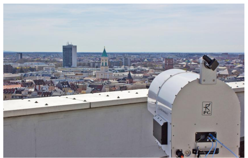
A distance of over one kilometer has already been covered by using a long range demonstrator between two skyscrapers in Karlsruhe.

Capacity of Fiber Optics Reached - Radio Links May Close Gaps in Future Broad-band Internet Supply